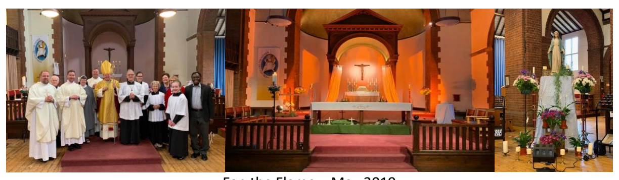
Fan the Flame – May 2019