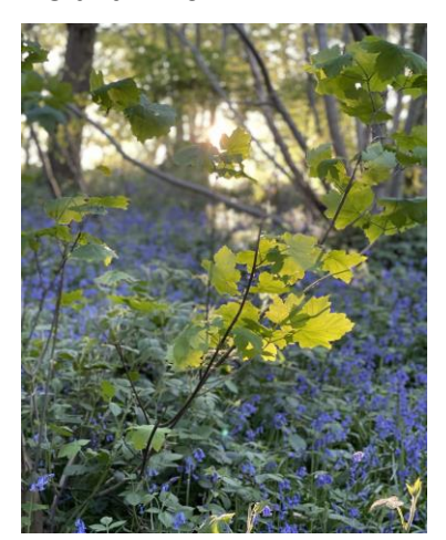
Lesnes Abbey Woods 2022

The parish has excellent rail links to central London. Belvedere station is a short walk from the church & Abbey Wood a 15 minute walk. Abbey Wood is the terminal for the new Elizabeth line with easy access to Canary Wharf and the City as well as regular trains to Dartford and Rochester. It has good road links to the A2/M2, M25 and M20.